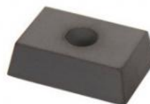
Blade for 7 Cutter Hoof Disc