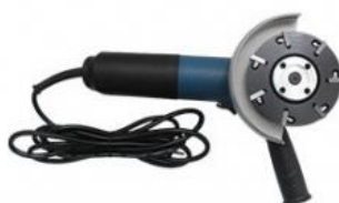
Hoof Trimming Machine with 7 cutter